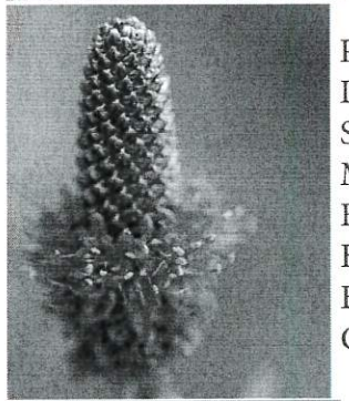
Purple Prairie Clover Dalea Purpurea

Light: Full Sun, Partial Soil: Moist, well drained Moisture: Wet to medium-wet Benefits: Rain gardens, Pollinators, Birds Height: 4' Blooms: Aug, Sept, Oct Color: Yellow