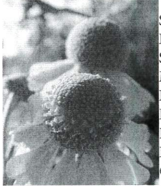
Sneezeweed Helenium autumnale

Light: Full Sun Soil: Tolerant to poor soils Moisture: Dry to Medium Benefits: Bees, deer resistant, Birds Height: 2' Blooms: Jun, July, Aug Color: Yellow