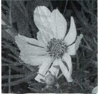
Prairie/Stiff Coreopsis Coreopsis palmata

Light: Full Sun Soil: Sand, Loam Moisture: Dry, Medium Benefits: Birds, Deer Resistant Height: 2'-4' Blooms: Aug, Sep Color: Straw-Gold