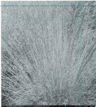
Prairie Dropseed Sporobolus heterolepis

Light: Full Sun Soil: Sand, Loam Moisture: Dry, Medium Benefits: Birds, Deer Resistant Height: 2'-4' Blooms: Aug, Sep Color: Straw-Gold